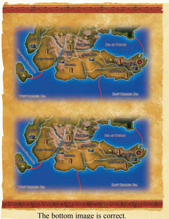
The bottom image is correct.

In some printings of the Clash of Kings expansion, the border separating the West Summer Sea and the East Summer Sea is misplaced. The border should extend from Starfall, not Salt Shore.